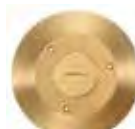
2 1/8" Single Receptacle