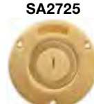
2 1/8" x 1" Combination