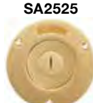
2 1/8" x 3/4" Combination