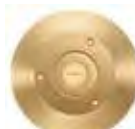
2 1/8" x 3/4" Combination