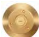
2 1/8" x 1" Combination