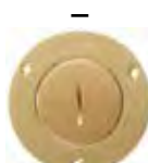
2 3/8" Single Receptacle