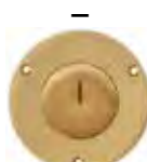
2 1/8" Single Receptacle (Terrazzo Floor)