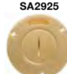
2 1/8" Single Receptacle