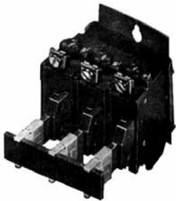
Three-Pole Fast Trip, Panel Mounted