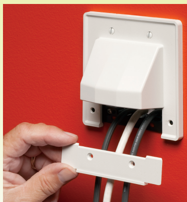
CER2 with Scoop facing OUT. Lower plate removed.