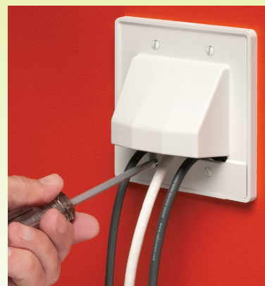
CER2 with Scoop facing OUT. Lower plate secured.

Each of our SCOOPs mounts directly to the wall with drywall screws. For added support, mount to one of Arlington's low voltage mounting brackets; LV1 to LV4.