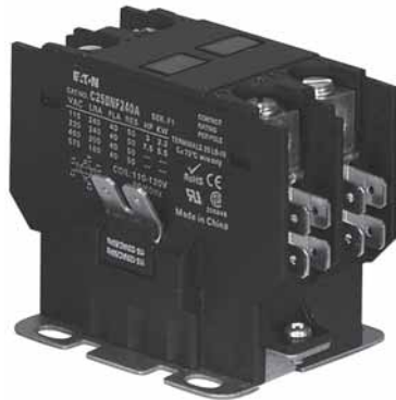
20–40A, Compact Single- and Two-Pole—C25