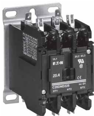
15–360A, Two-, Three- and Four-Pole—C25