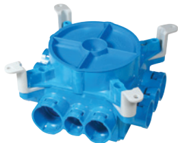
Mud box with one-gang ring