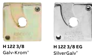
H 122 3/8 Galv-Krom® H 122 3/8 EG SilverGalv®

All threaded products are American Standard thread, free fit class 2. Galv-Krom® hardware finish is standard for all Superstrut products. This is a multi-process finish of electro-plated zinc, followed by gold-colored trivalent chromium finish to give excellent corrosion resistance and a superior paint base. Standard Finish – Galv-Krom®, unless otherwise stated.