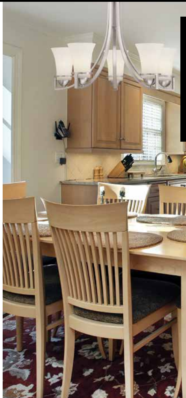
Nuvo Lighting's Neval five light chandelier in Brushed Nickel with Satin White Glass. Nuvo item number 60-5485. See the www.nuvolighting.com website.