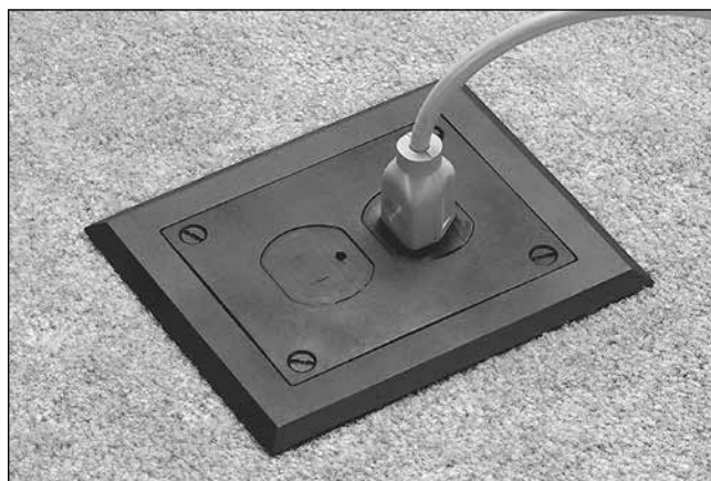
Source I Series Nonmetallic Single-Gang Flush Service Fitting.